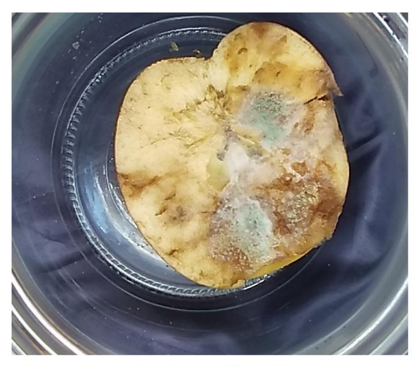
Control Sample - No Neutrino Chip